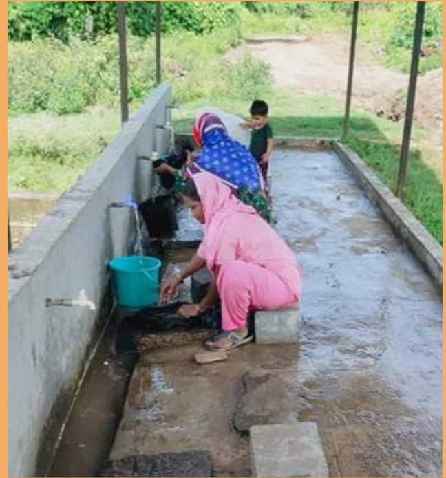
Use of Dhobi Ghat