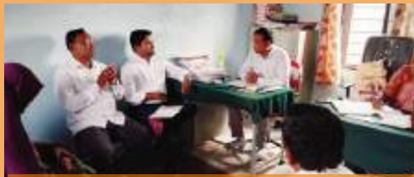
Meeting With Sarpanch for Strategy Development