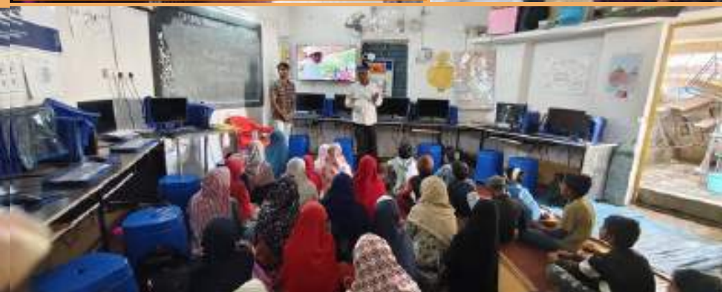
Film Screening on Heritage With Students of Kagzipura