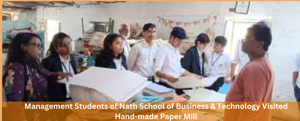
Management Students of Nath School of Business & Technology Visited Hand-made Paper Mill