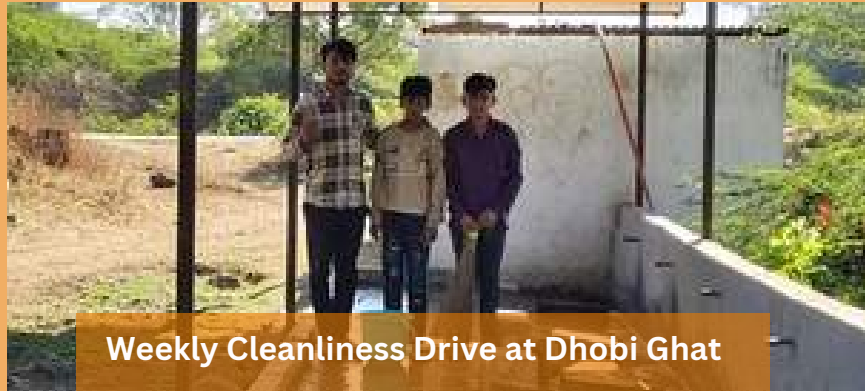
Weekly Cleanliness Drive at Dhobi Ghat