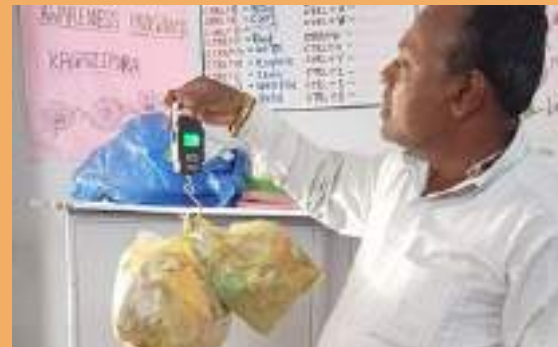
Plastic Waste Collection Drive