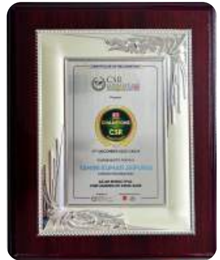
Impactful CSR Leader of India 2025