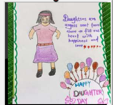
World Daughter's Day