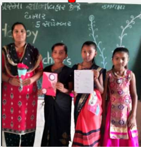
Teacher's Day with Students