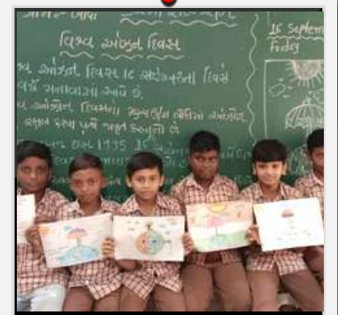
World Ozone Day