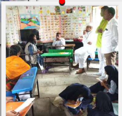
Interaction with School Managing Committee