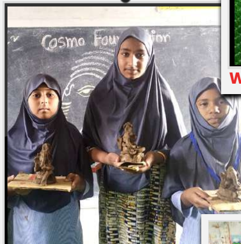
Ganpati Making Workshop