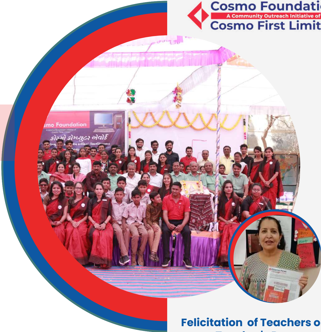
Felicitation of Teachers on Teacher's Day