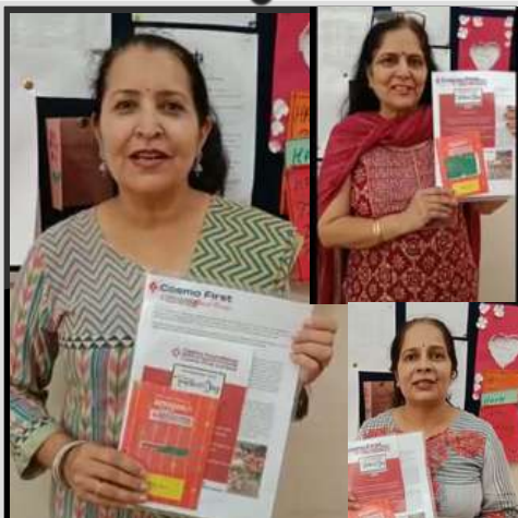
Felicitation of Teachers - Bal Vidhya Vihar, Delhi